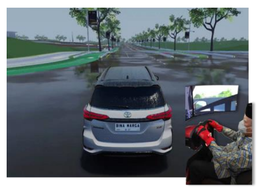
Fig. 2. Driving simulator on road and bridge infrastructure in Indonesia's New Capital City Planning

construction projects, including rapid transit systems, infrastructure projects, road infrastructure, and bridge construction. In the context of rapid transit systems, BIM has been employed for planning and delivery, enabling metro management companies, design and construction firms, and construction software vendors to leverage their capabilities for efficient project execution [6]. Furthermore, in infrastructure projects, collaboration-based BIM model development management systems have been instrumental for general contractors, emphasizing the need for effective construction management during BIM implementation [7]. Additionally, case studies have demonstrated the successful implementation of BIM in infrastructure projects, highlighting its potential for enhancing project outcomes and efficiency [8].