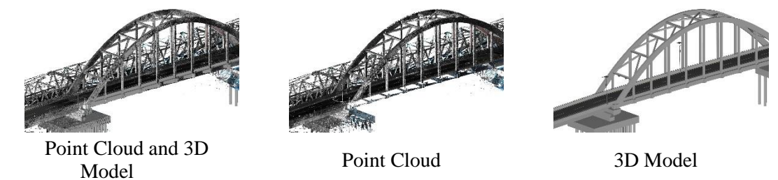
Fig. 6. Directorate General of Highways's digital twin on bridge asset management

Information is shared in a centralized and accessible manner, fostering a collaborative ecosystem that contributes to the overall success of infrastructure projects.