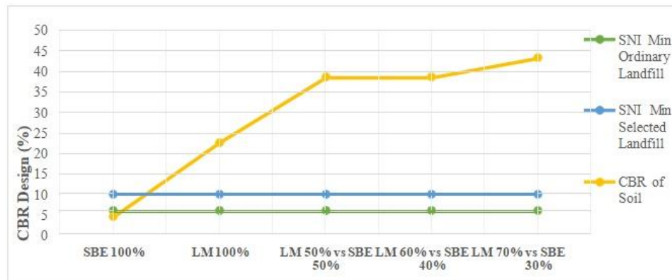
Fig 3. California Bearing Ratio (CBR) test result