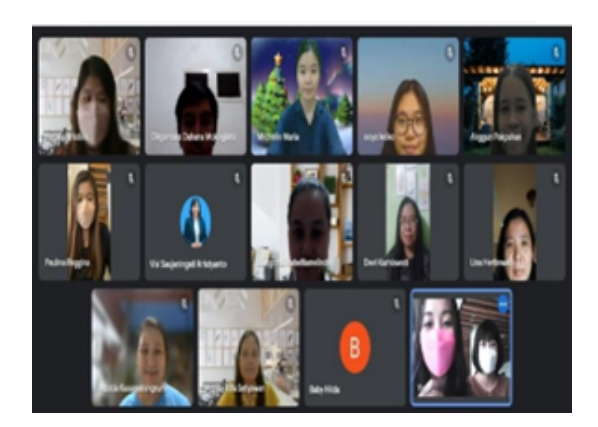
Gambar 3 Zoom meeting.

Mentoring activities have been carried out for one month using online meetings and what's app chat since December 2021. Participants are given access to all available materials and are assisted by mentors in identifying expenses and income. Identification is made by collecting purchase or payment receipts. The data is recorded into the Microsoft Excel template that has been provided. The results from Microsoft Excel can show the production price of each product sold and which product has the highest sales value. The mentoring activity was chosen because it is considered to improve the participants' understanding of the material; in addition, participants can directly practice the knowledge provided and immediately consult if they experience difficulties<sup>[2]</sup>. This learning for community service participants is a way form of innovation event for them. It is also a form of risk-taking behavior that allows innovation using the technology of Microsoft Excel in record keeping<sup>[3]</sup>. This innovation may make them more difficult or slower to run the business at the beginning of recording transaction adjustments, yet they are very happy and very enthusiastic.