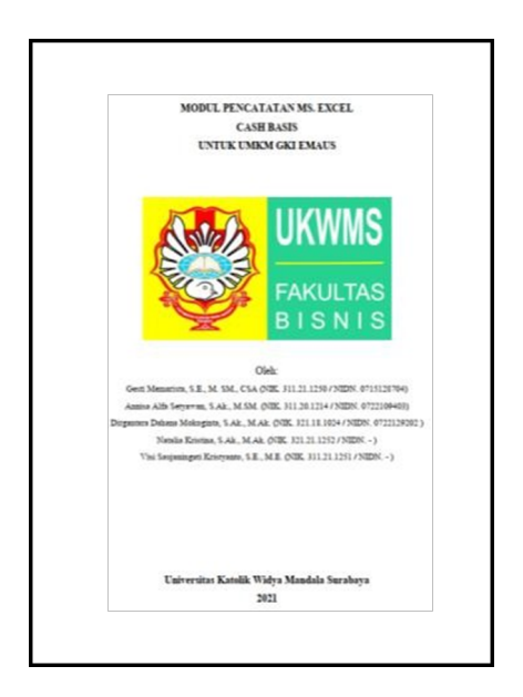
Gambar 1 Microsoft excel module.

The infrastructure of this activity is a Microsoft Excel-based financial recording module and a laptop. The method used is the method of training and mentoring after training. The training activities were carried out for two parties, namely the microbusiness community and several students who had been selected and trusted to be companions for the training participants. Students as mentors communicate with the lecturer team as the material maker during the mentoring period.