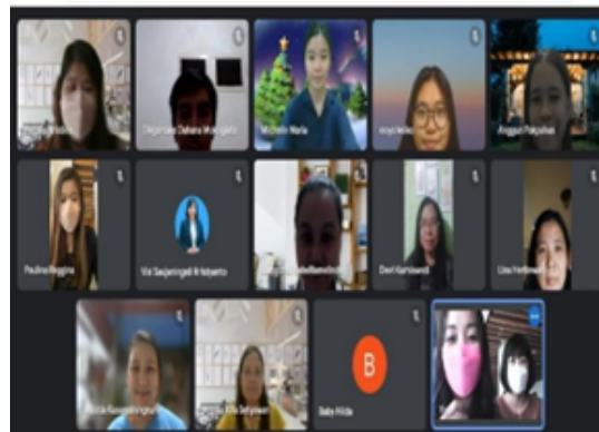
Gambar 3 Zoom meeting.

Mentoring activities have been carried out for one month using online meetings and what's app chat since December 2021. Participants are given access to all available materials and are assisted by mentors in identifying expenses and income. Identification is made by collecting purchase or payment receipts. The data is recorded into the Microsoft Excel template that has been provided. The results from Microsoft Excel can show the production price of each product sold and which product has the highest sales value. The mentoring activity was chosen because it is considered to improve the participants' understanding of the material; in addition, participants can directly practice the knowledge provided and immediately consult if they experience difficulties [2] . This learning for community service participants is a way form of innovation event for them. It is also a form of risk-taking behavior that allows innovation using the technology of Microsoft Excel in record keeping [3] . This innovation may make them more difficult or slower to run the business at the beginning of recording transaction adjustments, yet they are very happy and very enthusiastic.